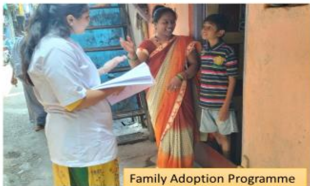
Family Adoption Programme

Pune, Maharashtra, India sewage treatment plant, Naidu campus, Pune, Maharashtra 411011, India Lat 18.514213° Long 73.862286° 01/06/23 11:28 AM GMT +05:30