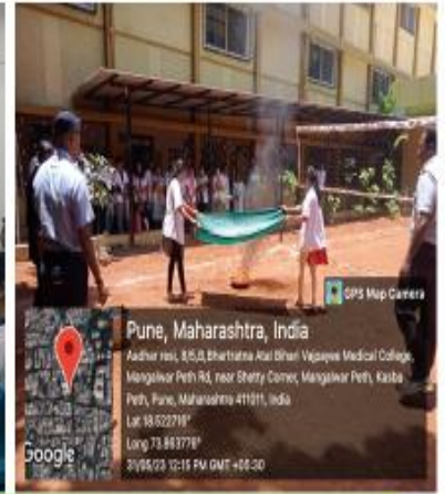
Disaster Management Programme with Demonstration

Pune, Maharashtra, India Auditor nos, 8/5, B, Bhartraha Atal Bihari Vajpayee Medical College, Mangalwar Peth Rd, near Shetty Corner, Mangalwar Peth, Kasba Peth, Pune, Maharashtra 411011, India Lat 18.522710° Long 73.863779° 31/05/23 10:15 PM GMT +05:30