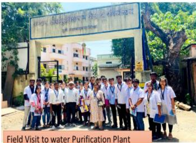
Field Visit to water Purification Plant

Pune, Maharashtra, India Auditor nos, 8/5, B, Bhartraha Atal Bihari Vajpayee Medical College, Mangalwar Peth Rd, near Shetty Corner, Mangalwar Peth, Kasba Peth, Pune, Maharashtra 411011, India Lat 18.522710° Long 73.863779° 31/05/23 10:15 PM GMT +05:30