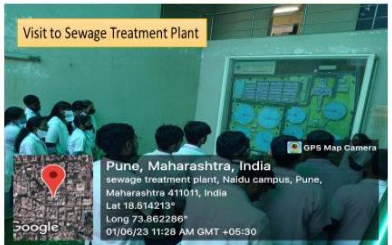
Visit to Sewage Treatment Plant

Pune, Maharashtra, India sewage treatment plant, Naidu campus, Pune, Maharashtra 411011, India Lat 18.514213° Long 73.862286° 01/06/23 11:28 AM GMT +05:30