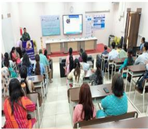
CME- Yes We can End TB